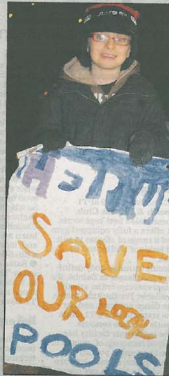
ONE of many protesters at last Wednesday's packed Cabinet meeting.

In our view, none of the current facilities should be allowed to close their